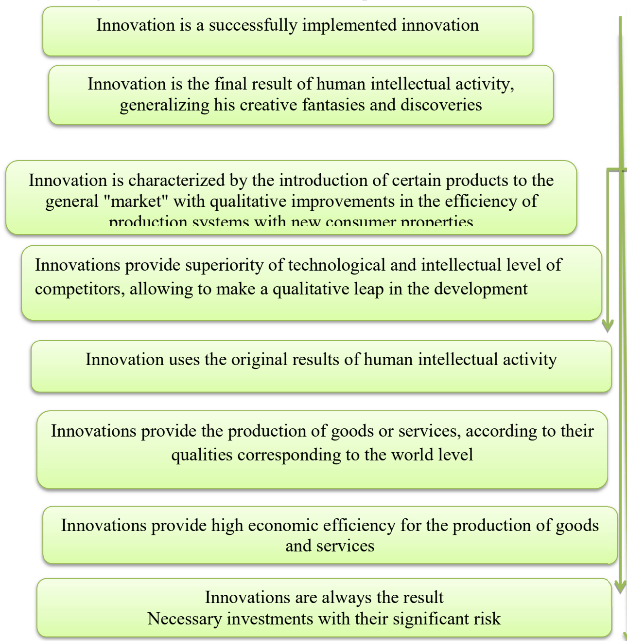
Figure 1 Characteristics of the concept of "innovation"

Thus, summarizing the wide range of different approaches to the conceptualization of the very concept of "innovation" available in the scientific and methodological literature, we can distinguish a list of its main characteristics (Fig. 1.1)